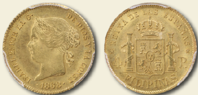
Philippines 1868 4 pesos Manila mint PCGS MS64 Actual piece pictured in The Coins of Queen Isabel II of Spain AV (0.875 gold) 21mm 12h Edge: reeded Type: Laureate Head Left O'Connor p.181 4P-1868m

The Isabel II gold 4 peso was minted from 1861 to 1868 and has only one type. It is slightly smaller in diameter and weight than the Spanish 100 reales and 10 escudos coins, as it was based on Kingdom period weights and gold to silver ratios, with one peso fuerte equal to 8 reales de plata fuerte or 20 reales de vellón. Thus, the Philippine 4 peso coin was equivalent to the Kingdom period 80 reales de vellón gold coin at 6.76g of 0.875 fine gold.