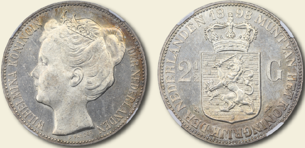
Netherlands 1898 2 ½ gulden PCGS MS64 ex Lissner AR (0.945 silver) 25g 38mm 6h Edge: GOD ★ ZIJ ★ MET ★ ONS ★ Type: Young Head Left KM #123

The early silver coins of Queen Wilhelmina were issued in relatively small numbers and circulated heavily. They are seldom encountered in problem free uncirculated condition. The 2 ½ gulden is the best example of this. It is estimated that fewer than a dozen of these coins remain in gem condition.