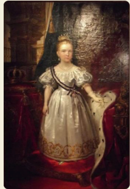
Isabel II niña - painting by Carlos Ruiz de Ribera, 1836

In 1833 several proclamation medals were issued in silver and gold in sizes similar to existing coins, but without a stated denomination. Many of these likely saw use in commerce based on their weight. A few regular issue 4 reales and 80 reales coins were struck as early as 1834, but most denominations were issued beginning in 1836.