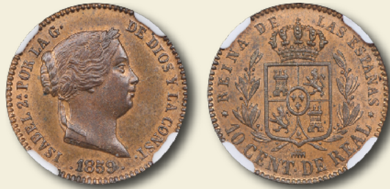
Spain 1859 10 céntimos de real Segovia mint NGC MS65RB AE (bronze) 20mm 12h Edge: plain Type: Laureate Head Right - ribbon on neck O'Connor p.124 10CR-1859a

The 10 céntimos de real were of a single type issued from 1854 to 1864 and all minted at Segovia. The coin pictured here exhibits beautiful red-brown surfaces with lustrous highlights in the hair and laurel wreath.