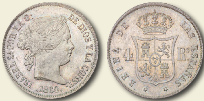
Spain 1864 4 reales Madrid mint Uncirculated AR (0.900 silver) 23mm 12h Edge: reeded Type: Laureate Head Right O'Connor p.128 4R-1864M

This particular coin has lovely surfaces with a hint of colorful toning in some areas of the date and legends on the obverse. Although the luster of the reverse is subdued, the devices are sharp.