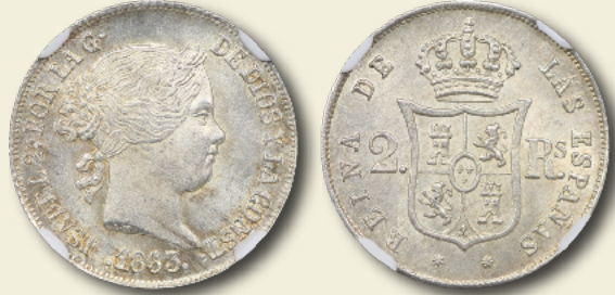
Spain 1863 2 reales Seville mint NGC MS64 AR (0.900 silver) 18mm 12h Edge: reeded Type: Laureate Head Right O'Connor p.127 2R-1863S

This particular coin has lustrous mirrorlike fields with frosty devices and a hint of pleasing edge toning. Though small silver coins of this period are more readily available in XF condition or above than their larger siblings, this example is the closest to perfection that this author has encountered for the type.