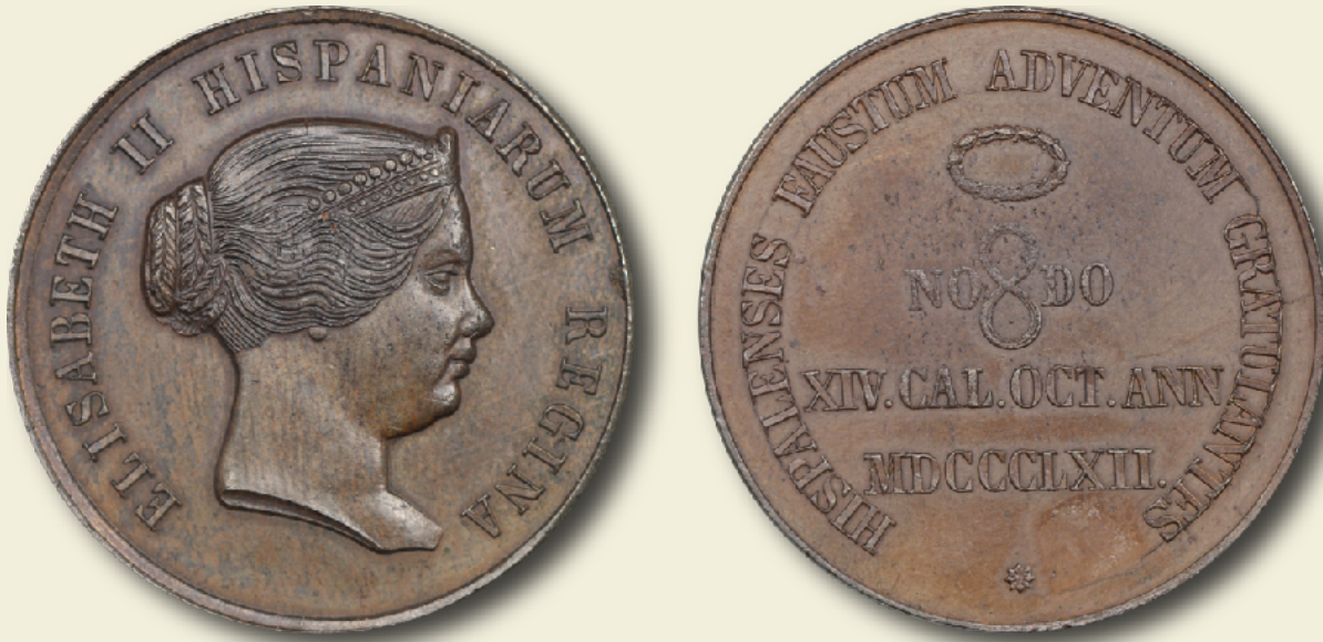
Spain 1862 Medal - Queen's Visit to Seville in October AE 28.63g 37.3mm x 3.3mm Edge: plain Type: Laureate Head of Queen Isabel II Right O'Connor p270 M1862AE-SevilleOct

The legend on obverse translates to Isabel II Queen of Spain. The latin legend on reverse translates roughly as "Seville thanks you for visiting" and the inscription NO 8 DO (the motto of Seville) followed by the long form date 14 October 1862.