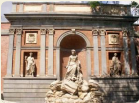
Fountain of Canal de Isabel II in Madrid

By 1864 officials from several countries in Europe were meeting to discuss standardization of coinage to facilitate trade and combat the problems of having different gold to silver exchange ratios. The Latin Monetary Union was formed in 1865 among France, Belgium, Italy, and Switzerland. It standardized the exchange ratio of gold to silver and established coin specifications based on the existing French coins. Based on this, the correct weight of a 5 franc or 20 reales coin to make them directly interchangeable would be 25.0g at 0.900 fine yielding 22.5g of pure silver.