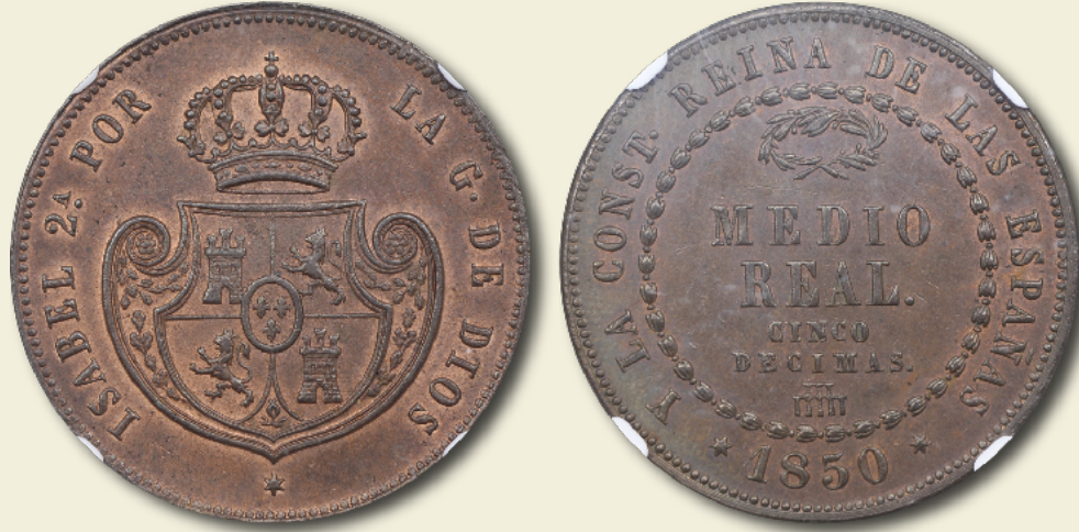
Spain 1850 medio real Segovia mint NGC MS63BN AE (copper) 31mm 12h Edge: plain Type: Crowned Ornate Arms - Large Wreath Reverse O'Connor p.112 MR-1850a

This is a 5 décima de real, most commonly referred to as medio real (half real). There were four types of the medio real (1848-1853). They are distinguished by what appears in the area above the denomination on reverse: starburst, plain, small wreath, or large wreath. The first three of these varieties were essentially tests, though a number of plain and small wreath types did enter circulation. The large wreath type was ultimately settled on for production in 1850 and was produced each year until 1853. The example above is of the large wreath variety and the aqueduct mint mark above the date identifies it as being struck at the Segovia mint. Eye appealing uncirculated examples are quite scarce.