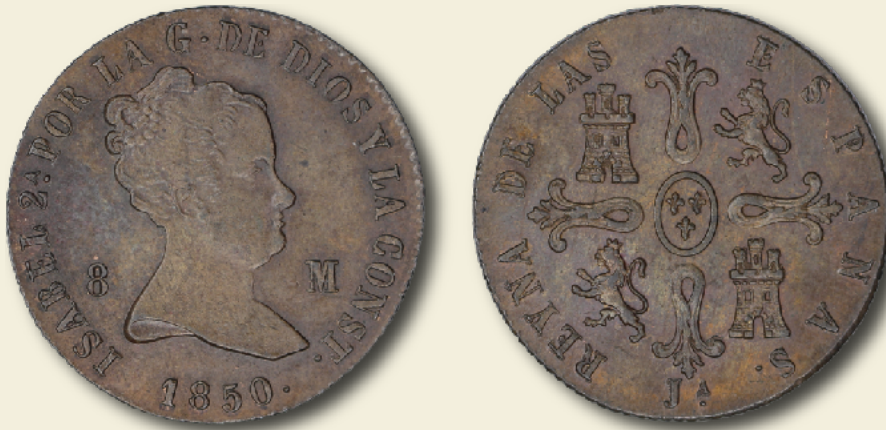
Spain 1850 8 maravedís Jubia mint NGC MS64RB AE (copper) 9.93g 28.1mm x 1.9mm 12h Edge: reeded Type: Pearl Bun Head Right - Denomination on Obverse - CONST O'Connor p.86 8M-1850J

Spain issued three types of 8 maravedís during the reign of Isabel II. All of them pictured Isabel II on obverse and a stylized cross with castles & lions on the reverse. The first type had a legend that ended DIOS with denomination on the reverse, the second type was a crudely cast coin from Pamplona (the only official cast coin of Isabel's reign), and the third was like the first except that the denomination is on the obverse and the legend ends CONST since the legend was modified to "... GRACIA DE DIOS Y LA CONST."