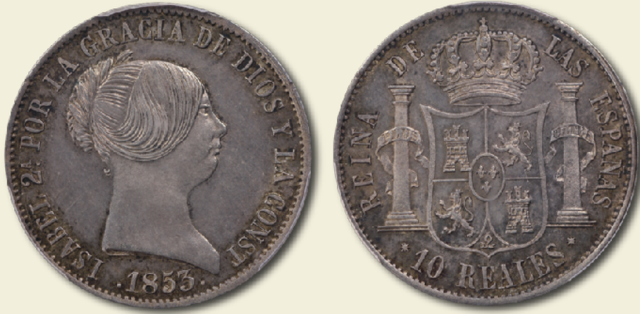
Spain 1853 10 reales Barcelona mint PCGS MS62 AR (0.900 silver) 29mm 12h Edge: LEY PATRIA REY * * * Type: Looped Braid Head Right O'Connor p.116 10R-1853B

The silver and gold coins of this period are characterized by the Looped Braid Head Right type on the obverse. As with the designs of the Kingdom period the engraver adapted the queen's appearance and hairstyle for the coins. The queen often wore a looped braid hairstyle which was depicted in various forms on the decimal coins from this point onward.