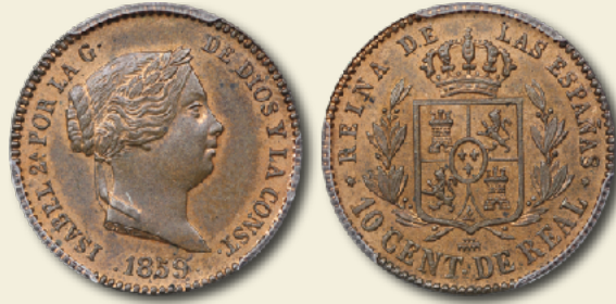
Spain 1859 10 céntimos de real Segovia mint PCGS MS64RB AE (bronze) 20.1mm 12h Edge: plain Type: Laureate Head Right - ribbon on neck O'Connor p.124 10CR-1859a

The 10 céntimos de real were of a single type issued from 1854 to 1864 and all minted at Segovia. The coin pictured here exhibits beautiful red-brown surfaces with lustrous highlights in the hair and laurel wreath.