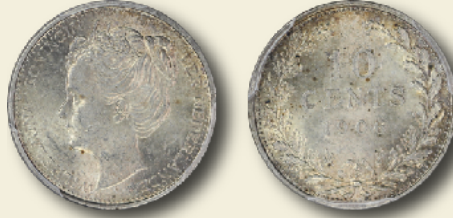
Netherlands 1906 10 cents PCGS MS63 AR (0.640 silver) 15mm 6h Type: Young Head Left KM #136

The early silver coins of Queen Wilhelmina were issued in relatively small numbers and circulated heavily.