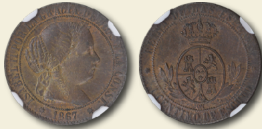
Spain 1867 1 céntimo de escudo Seville mint NGC MS65BN - ex Lissner AE (bronze) 18mm 12h Edge: plain Type: Ringlet Head Right O'Connor p.144 1CE-1867S-OM

Isabel II 1 céntimo were struck from 1865 through 1868 of one type and two major varieties. The first variety without the initials "OM" on the reverse beneath the oval and the second variety with the "OM" mark. Both varieties were struck by Oeschger Mesdach & Co., but early issues lacked the "OM" marking.