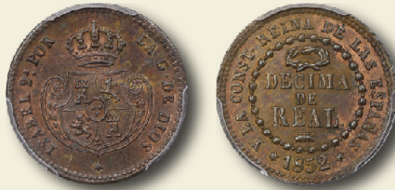
Spain 1852 décima de real Segovia mint PCGS MS63BN AE (copper) 3.95g 19.6mm x 1.8mm 12h Edge: plain Type: Crowned Ornate Arms O'Connor p.107 DR-1852a

The coin pictured here is a near gem example with beautiful coppery iridescent toning, transitioning from dark to light as the coin is tilted and rolled in hand.