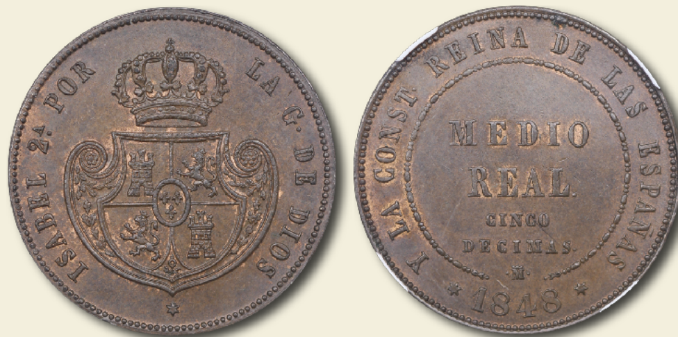
Spain 1848 medio real Madrid mint NGC MS63BN AE (copper) 31mm 12h Edge: plain Type: Crowned Ornate Arms - Plain Ring Reverse O'Connor p.110 MR-1848M

This is a 5 décima de real, most commonly referred to as medio real (half real). There were four types of the medio real (1848-1853). They are distinguished by what appears in the area above the denomination on reverse: starburst, plain, small wreath, or large wreath. The first three of these varieties were essentially tests, though a number of plain and small wreath types did enter circulation. The large wreath type was ultimately settled on for production in 1850 and was produced each year until 1853. The example above is of the plain variety and the M mint mark above the date identifies it as being struck at the Madrid mint. Eye appealing uncirculated examples are quite scarce.