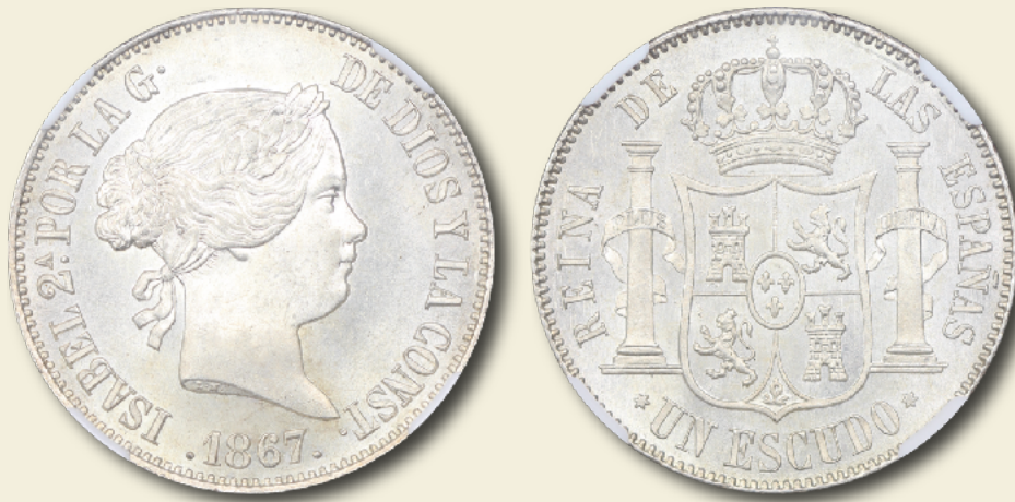
Spain 1867 1 escudo Madrid mint NGC MS64 AR (0.900 silver) 29.5mm 12h Edge: LEY PATRIA REY * * * Type: Laureate Head Right O'Connor p.152 1E-1867M

The coin pictured above has considerable luster remaining with numerous marks commensurate with the grade. A very nice example of the type.