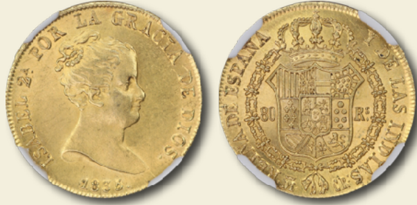
Spain 1835 80 reales Madrid mint NGC MS63 Assayers: CR = José Luis de C astroviejo - Isidro R amos del Manzano AV (0.875 gold) 21mm 12h Edge: reeded Type: Pearl Bun Head Right - Legend Ends DIOS O'Connor p.100 80R-1835M-CR

Spain issued three types of Kingdom 80 reales of Isabel II. They are distinguished by the legend ending DIOS, CONSTITUCION, or CONST. All of them pictured Isabel II on the obverse and crowned arms encircled by the Chain of the Order of the Golden Fleece on the reverse.