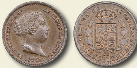
Spain 1859 5 céntimos de real Segovia mint MS64+BN - ex Permanyer AE (bronze) 17.1mm 12h Edge: plain Type: Laureate Head Right - ribbon on neck O'Connor p.123 5CR-1857a

The 5 céntimos de real were of a single type issued from 1854 to 1864 and all minted at Segovia. The coin pictured here exhibits beautiful red-brown surfaces with red iridescent luster in the reverse fields.