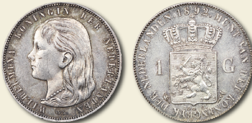
Netherlands 1892 1 gulden PCGS MS64 AR (0.945 silver) 28mm 6h Edge: ★ GOD ★ ZY ★ MET ★ ONS Type: Young Head with Long Hair Left KM #117

This 10 cents issue is lustrous with hints of toning is an excellent example of the type.