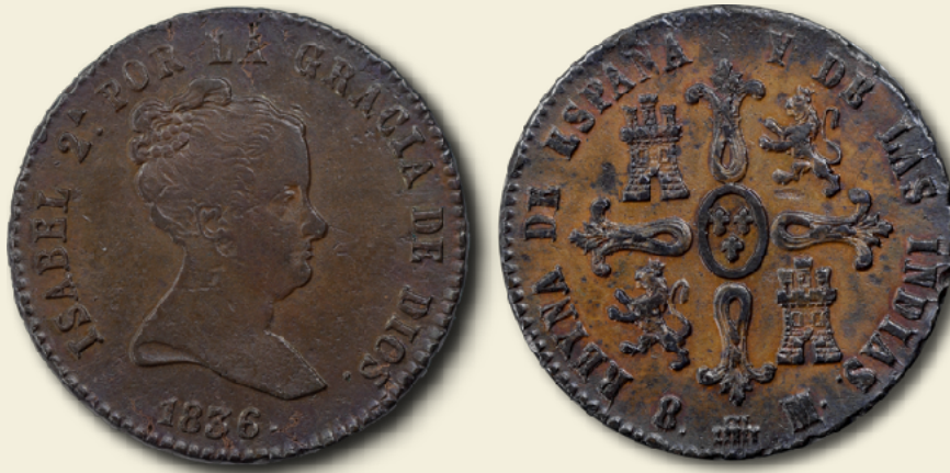
Spain 1836 8 maravedís Segovia mint PCGS AU details Actual piece pictured in The Coins of Queen Isabel II of Spain AE (copper) 29.0mm x 2.1mm 12h Edge: laurel leaves pattern Type: Pearl Bun Head Right - Denomination on Reverse - DIOS O'Connor p.83 8M-1836a

Spain issued three types of 8 maravedís during the reign of Isabel II. All of them pictured Isabel II on obverse and a stylized cross with castles & lions on the reverse. The first type had a legend that ended DIOS with denomination on the reverse, the second type was a crudely cast coin from Pamplona (the only official cast coin of Isabel's reign), and the third was like the first except that the denomination is on the obverse and the legend ends CONST since the legend was modified to "... GRACIA DE DIOS Y LA CONST."