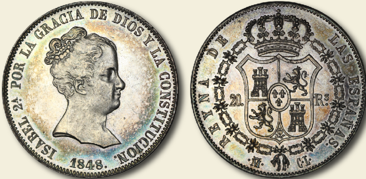
Spain 1848 20 reales Madrid mint PCGS AU58 - ex O'Callaghan Actual piece pictured in The Coins of Queen Isabel II of Spain Assayers: CL = José Luis de Castroviejo - Eugenio Larra AR (0.9027 silver) 26.25g 36.8mm 12h Edge: LEY PATRIA REY * * * Type: Pearl Bun Head Right - Legend Ends CONSTITUCION O'Connor p.99 20R-1848M-CL

Spain issued two types of Kingdom 20 reales of Isabel II. They are distinguished by the legend, with one ending DIOS and the other ending CONSTITUCION. All of them pictured Isabel II on the obverse and crowned arms encircled by the Chain of the Order of the Golden Fleece on the reverse.