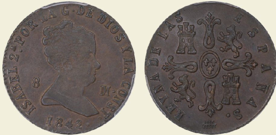
Spain 1842 8 maravedís Segovia mint PCGS MS62BN AE (copper) 28mm 12h Edge: reeded Type: Pearl Bun Head Right - Denomination on Obverse - CONST O'Connor p.85 8M-1842a

Spain issued three types of 8 maravedís during the reign of Isabel II. All of them pictured Isabel II on obverse and a stylized cross with castles & lions on the reverse. The first type had a legend that ended DIOS with denomination on the reverse, the second type was a crudely cast coin from Pamplona (the only official cast coin of Isabel's reign), and the third was like the first except that the denomination is on the obverse and the legend ends CONST since the legend was modified to "... GRACIA DE DIOS Y LA CONST."