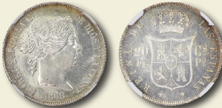
Philippines 1868 20 centavos de peso Manila mint NGC MS63 AR (0.900 silver) 23.8mm 12h Edge: Reeded Type: Laureate Head Right O'Connor p.175 20CP-1868m

The coin pictured above has bold luster with hints of champagne toning on both obverse and reverse. The finest and most attractive example of this issue seen by this author.