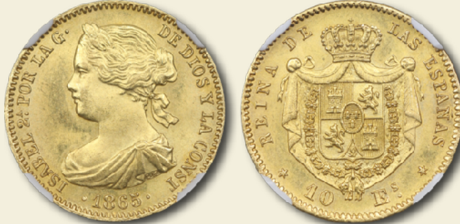
Spain 1865 10 escudos Madrid mint NGC MS65 AV (0.900 gold) 22mm 12h Edge: LEY PATRIA REY *** Type: Draped Laureate Bust Left O'Connor p.157 10E-1865M

The coin pictured above has relatively few marks and mint fresh luster throughout. The portrait of Isabel II is beautifully accentuated by frosty luster over most of her face and hair. Similarly bold luster and frosty devices appear on the reverse. The finest example of this date and certainly among the finest of any date seen by this author.