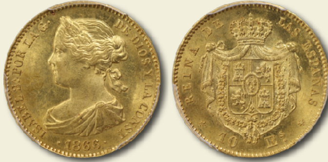
Spain 1866/5 10 escudos Madrid mint PCGS MS62 AV (0.900 gold) 22mm 12h Edge: LEY PATRIA REY *** Type: Draped Laureate Bust Left O'Connor p.157 10E-1866M

The 10 escudos was issued from 1865 to 1868.