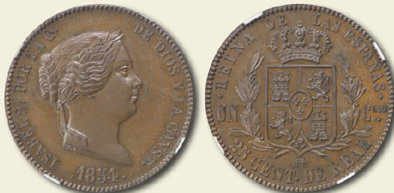
Spain 1854 25 céntimos de real Segovia mint NGC PF66BN AE (bronze) 26mm 12h Edge: plain Type: Laureate Head Right - ribbon on neck O'Connor p.125 25CR-1854a

The 25 céntimos de real were of a single type issued from 1854 to 1864. In addition to Segovia, the Barcelona mint issued these in 1863 and 1864. Prior to the initial issue in 1854 several proof examples were made. The coin pictured here is one of those proof issues. It has exquisite chocolate brown surfaces and razor sharp details. Tied for finest seen by this author (with the other example offered in this group).