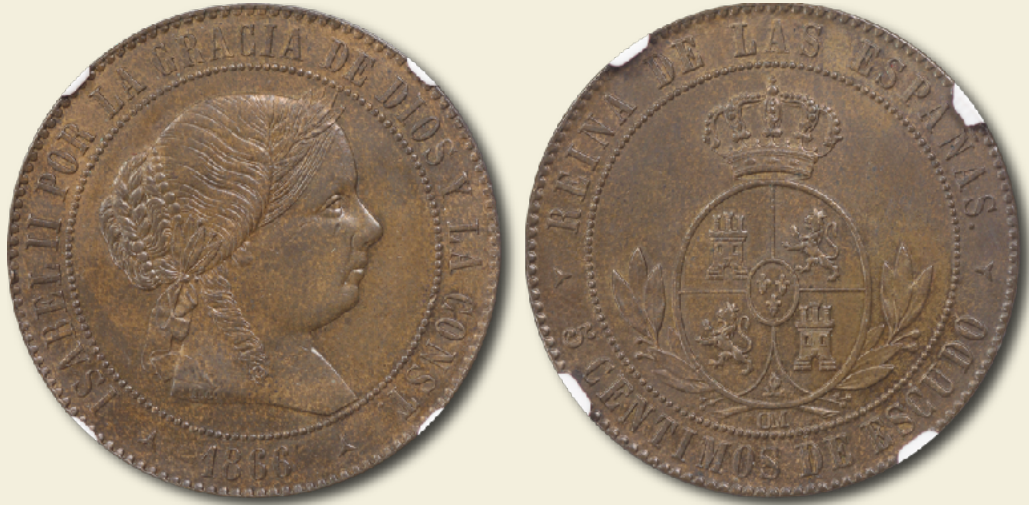
Spain 1866 5 céntimos de escudo Segovia mint NGC MS64BN - ex Lissner AE (bronze) 32mm 12h Edge: plain Type: Ringlet Head Right O'Connor p.148 5CE-1868B-OM

Isabel II 5 céntimos were struck from 1865 through 1868 of one type and two major varieties. The first variety without the initials "OM" on the reverse beneath the oval and the second variety with the "OM" mark. Both varieties were struck by Oeschger Mesdach & Co., but early issues lacked the "OM" marking.