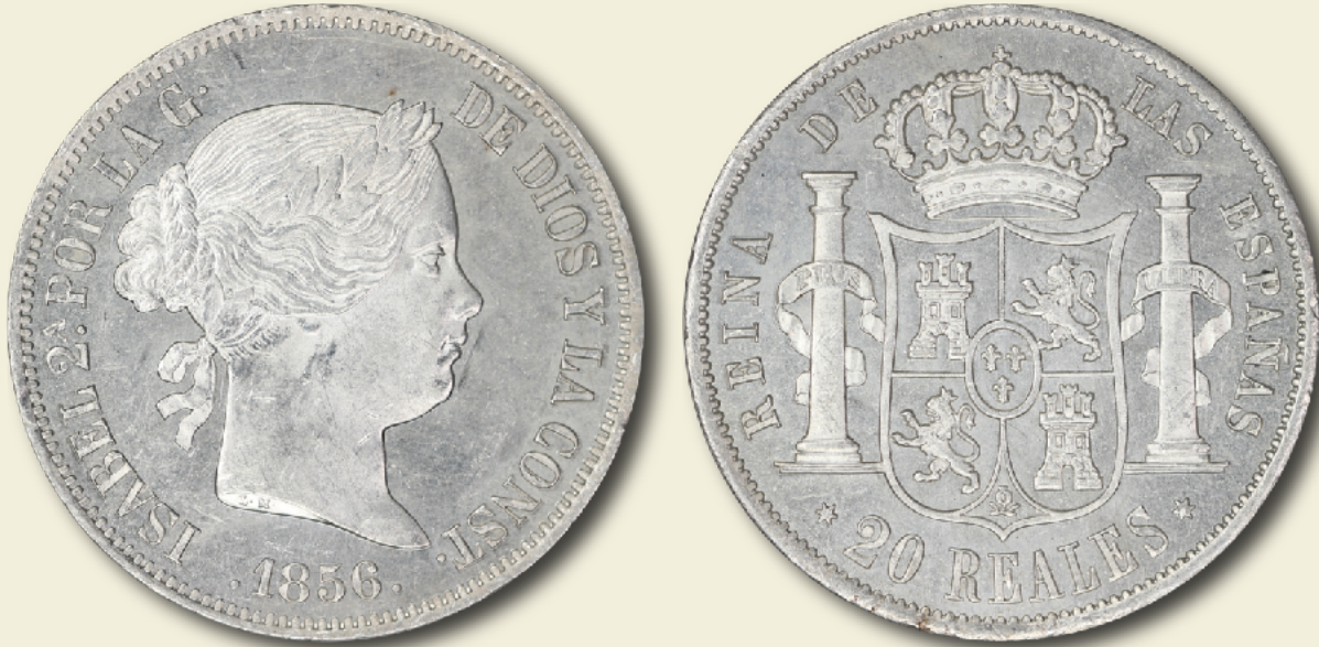
Spain 1856 20 reales Madrid mint NGC MS62+ AR (0.900 silver) 26.01g 36.9mm x 2.6mm 12h Edge: LEY PATRIA REY * * * Type: Laureate Head Right O'Connor p.132 20R-1856M

The 20 reales of this type were issued from 1856 to 1864 at the Madrid, Seville, and Barcelona mints. As the primary store of silver among coins of Spain and possessing more silver content than most similarly sized coins of Europe at the time, 20 reales coins were heavily exported throughout Isabel's reign. Finding an appealing example is very challenging in any grade. AU examples are rarely seen and uncirculated examples are almost never seen. So scarce are these coins in eye appealing, problem free condition that coins with nice eye appeal which exhibit mild cleaning or small scratches are often acceptable to collectors.