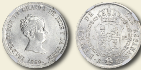
Spain 1850 2 reales Seville mint NGC MS63 Assayers: RD = Benito de R oxas - Vicente D elgado AR (0.8125 silver) 18.2mm 12h, Edge: reeded Type: Pearl Bun Head Right - Legend Ends CONST O'Connor p.89 2R-1850S-RD-f

The coin pictured above is of the third type with legend ending CONST. This particular example is a rich, lustrous red-brown. The slightly weak strike evident in some elements of the reverse may be the only thing keeping this from a full gem grade. Regardless, an exceptionally attractive example of the type.