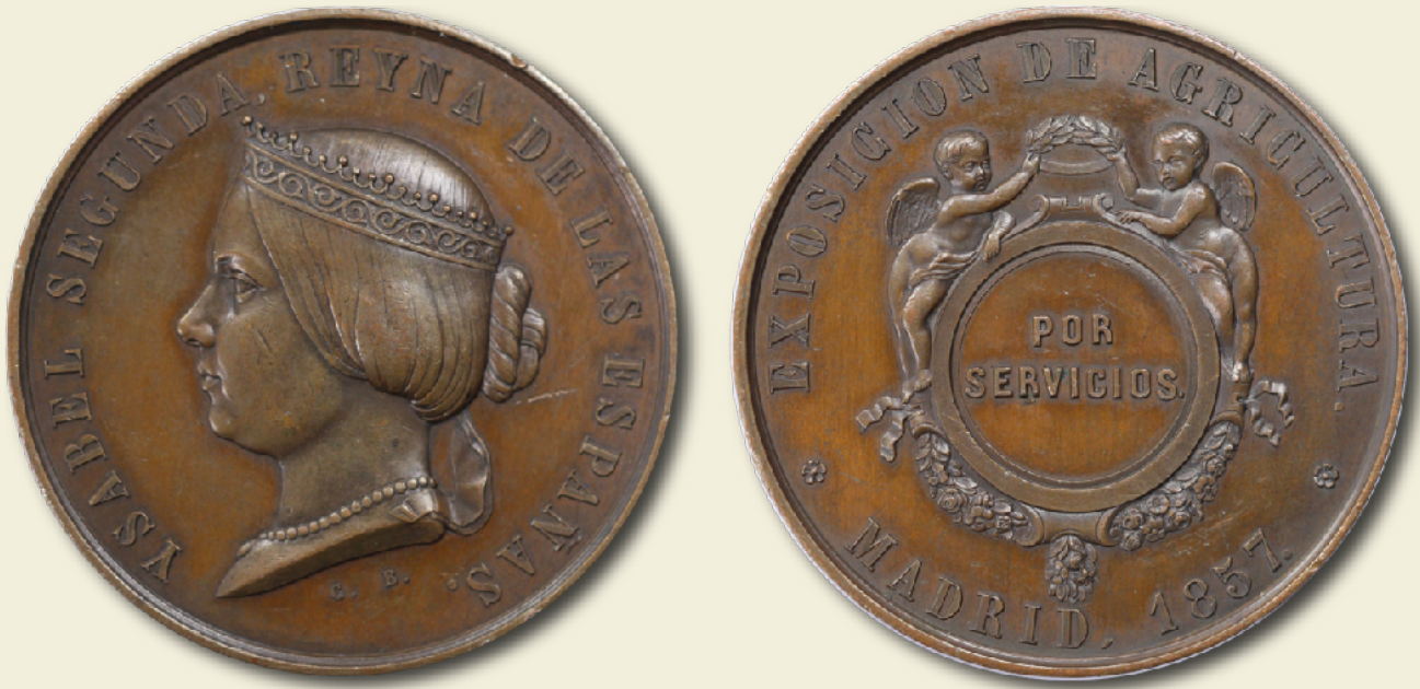
Spain 1857 Medal - Madrid Agricultural Exposition - For Service Actual piece pictured in The Coins of Queen Isabel II of Spain AE 39.53g 43.5mm x 3.5mm Edge: plain with <pointing hand> "CUIVRE" O'Connor p259 M1857AE-ExpoService

The Royal Decree of 11 March 1857 established the guidelines for the Agricultural Exposition in Madrid.