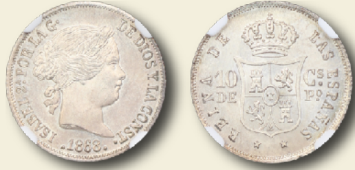
Philippines 1868 10 centavos de peso Manila mint NGC MS65 Actual piece pictured in The Coins of Queen Isabel II of Spain AR (0.900 silver) 18mm 12h Edge: reeded Type: Laureate Head Right O'Connor p.174 10CP-1868m

The Isabel II silver 10 centavos de peso was minted from 1865 to 1868 and has only one type. It is similar in size and weight to the 20 céntimos de escudo of Spain, but with higher purity, and has the same design elements with the exception of the denomination on the reverse and the five pointed stars surrounding it. The five pointed stars identify it as a product of the Manila mint.