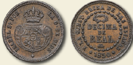
Spain 1850 décima de real Segovia mint PCGS MS64BN AE (copper) 3.95g 19.6mm x 1.8mm 12h Edge: plain Type: Crowned Ornate Arms O'Connor p.107 DR-1850a

The first decimal period is defined primarily by the copper coinage denominations based on décima de real (tenths of a real). This is the 1 décima de real. There was only one type of the décima de real (1850-1853). The aquaduct mint mark above the date identifies these coins as being struck at the Segovia mint.