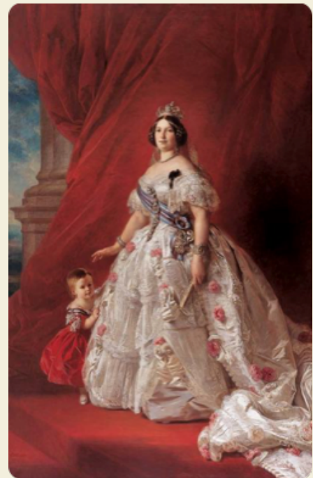
Queen Isabella II of Spain - painting by Franz Xavier Winterhalter, 1852

After the discovery of large quantities of gold in California, the value of gold relative to silver on the world market dropped. As silver 20 reales still contained more silver than other European coins of similar value, the export of 20 reales to the melting pots of Europe and elsewhere accelerated. The gold coins intended to act as a store of value were being dumped on the commercial centers and government of Spain in exchange for more valuable silver even as the value of gold dropped. Spain's government responded by suspending the minting of gold coins in 1851. Despite this decree occurring early in 1851, gold coins of this date and 1852 were issued. No Spanish gold coins were issued with a date of 1853. The Royal decree of 3 February 1854 restored the issuance of gold coins and again reduced the weight of the silver 20 reales.