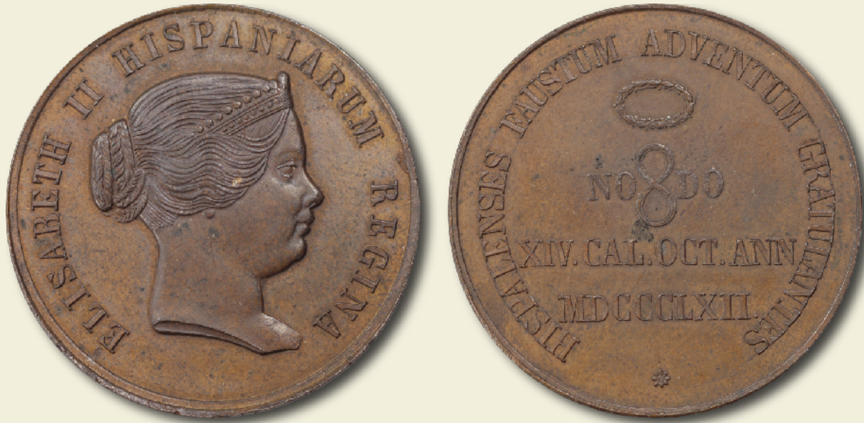
M1862AE-SevilleOct: 1862 Medal - Queen's Visit to Seville in October

Actual piece pictured in The Coins of Queen Isabel II of Spain