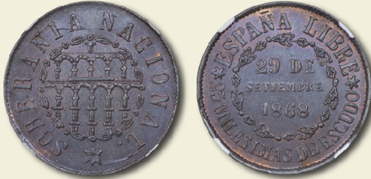
Spain 1868 25 milésimas de escudo Segovia mint NGC MS63BN - ex Barinaga Actual piece pictured in The Coins of Queen Isabel II of Spain AE (bronze) 25mm 12h Type: Aqueduct O'Connor p.159 25M-C-1868a

Following the Battle of Alcolea and the departure of Queen Isabel II on 29 September 1868 the first and only commemorative coin associated with Isabel II's reign was issued. This coin commemorates the event and proclaims Spain free.