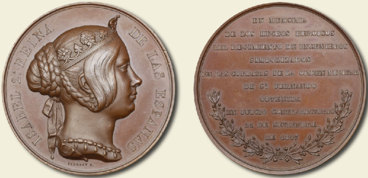
Spain 1850 Medal - Engineering Regiment - NGC MS63BN Actual piece pictured in The Coins of Queen Isabel II of Spain Type: Diadem Head Right Engraver: Joseph Arnold Pingret Mint: Paris AE 56.9mm 12h