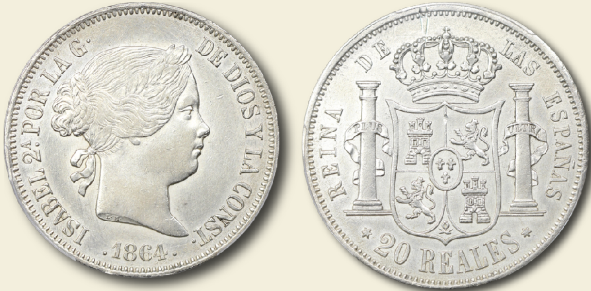
Spain 1864 20 reales Madrid mint PCGS AU details AR (0.900 silver) 37.1mm 12h Edge: LEY PATRIA REY *** Type: Laureate Head Right

The 20 reales of this type were issued from 1856 to 1864 at the Madrid, Seville, and Barcelona mints. As the primary store of silver among coins of Spain and possessing more silver content than most similarly sized coins of Europe at the time, 20 reales coins were heavily exported throughout Isabel's reign. Finding an appealing example is very challenging in any grade. AU examples are rarely seen and uncirculated examples are almost never seen. So scarce are these coins in eye appealing, problem free condition that coins with nice eye appeal which exhibit mild cleaning or small scratches are often acceptable to collectors.