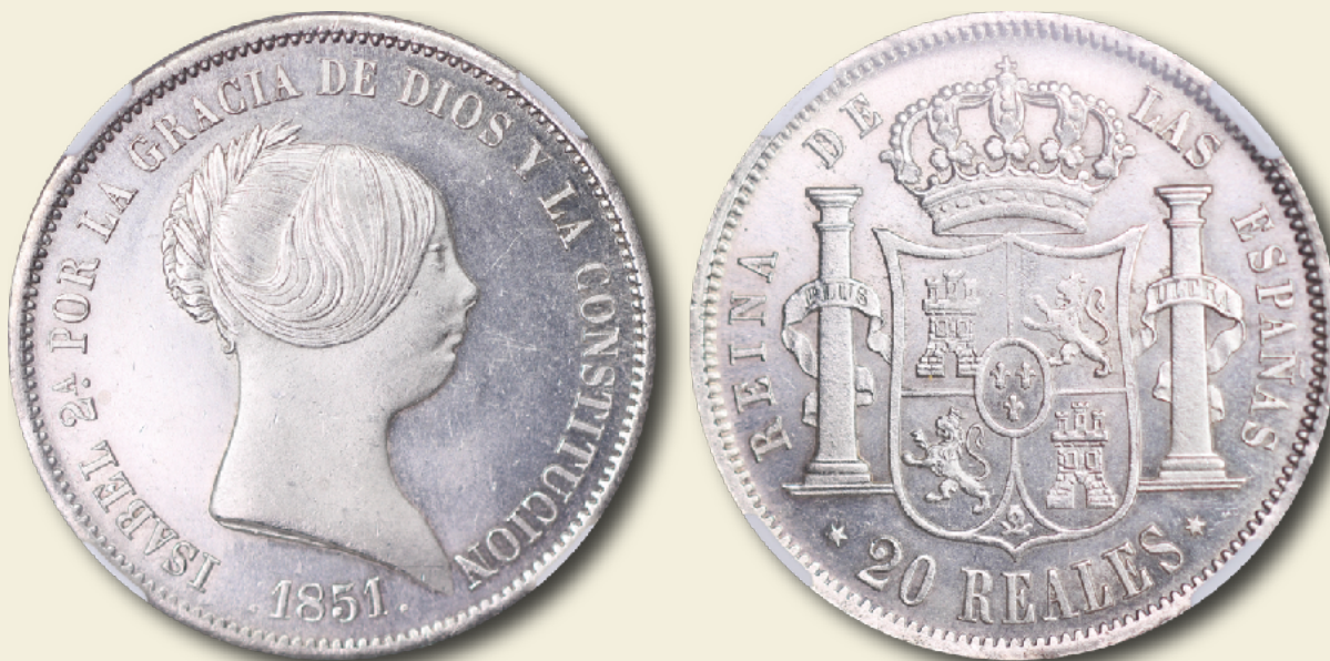
Spain 1851 20 reales Madrid mint NGC MS64 AR (0.900 silver) 37mm 12h Edge: LEY PATRIA REY *** Type: Looped Braid Head Right O'Connor p.119 20R-1851M

This looped braid design by Remigio Vega adorned the silver and gold coins of the 1st Decimal Period. The high points of obverse and reverse dies for this design type are directly opposite each other which, on 20 reales of this type, often results in characteristic weakness in the central hair details on obverse and top of shield, bottom of crown on reverse.