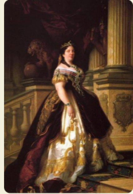
Isabella II of Spain - painting by Jose Casado del Alisal circa 1865

However, Spain's many revisions of its coinage continually failed to prevent export of its silver coins. Despite reducing the purity and weight in 1848 and again in 1854 the silver 20 reales coins still contained more silver than the 25 gram French 5 francs which were used interchangeably in commerce. Enterprising persons could exchange French 5 franc coins or 100 reales gold coins for an equal face value of Spanish 20 reales silver coins and make a profit simply by moving them from one place to another. All the better if the current gold to silver exchange ratio was favorable. Repeating the process several times was quite lucrative. However, it was devastating to Spain's limited supply of silver and to routine commerce. Average citizens of Spain were left with fewer and fewer coins with which to conduct daily business. Since very little paper money was issued by Spanish banks relative to the supply of coin, what coins remained were used to exhaustion. And despite efforts of Spanish government to ban foreign coins, the coins of France and other countries continued to circulate in Spain.