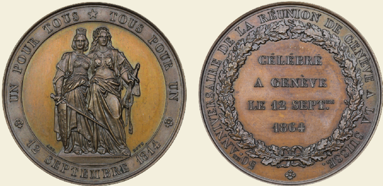
Switzerland 1864 50th Anniversary of Unification NGC MS64BN AE 59.82g 47mm 12h Edge: plain Type: Geneva and Helvetia standing Engraver: Hughes Bovy

When Napoleon took control of the Swiss cantons in 1798 he unified them as the Helvetic Republic, primarily for ease of administration. The Republic collapsed in 1803 and reverted to a loose confederation of cantons. Considerable upheaval and discourse carried on until the Long Diet met and afforded Geneva full membership in the Confederation in 1814. Soon after, the Congress of Vienna recognized Switzerland as an independent country and permanently neutral in European affairs. This medal celebrates the 50th anniversary of Geneva joining the Confederation.