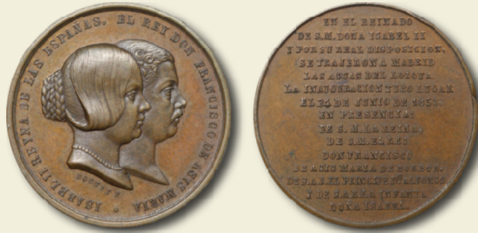
Spain 1858 Medal - Water Delivery from Lozoya River to Madrid AE 10.34g 26.31mm x 2.57mm Edge: plain with <pointing hand> "CUIVRE" O'Connor p260 M1858AE-Lozoya

This medal commemorates the beginning of water delivery from the Lozoya River into Madrid. In 1848 engineers Juan Rafo and and Juan de Ribera approached Juan Bravo Murillo, the Minister of Commerce, Education, and Public Works with plans to construct a canal from the Lozoya River to Madrid. With Murillo's recommendation the government of Isabel II issued a Royal Decree in 1848 directing engineers Juan Rafo and Juan de Ribera Rafo to begin work on the project. In 1851 the King Consort, Francisco, set the first stone for the canal that would eventually extend 70km from Lozoya River to Madrid. In 1858 a ceremony was held to celebrate the arrival of water from the Lozoya River to San Bernardo street in Madrid. This medal commemorates the presence of the royal family at the event.