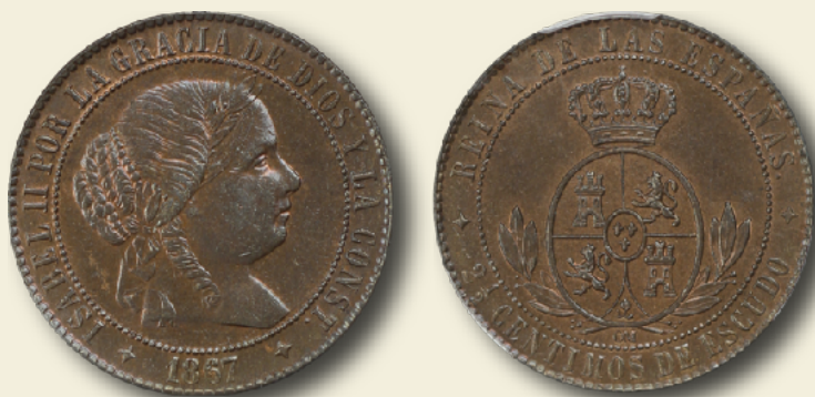
Spain 1867 2 1/2 céntimos de escudo Juvia mint PCGS MS64BN AE (bronze) 25mm 12h Edge: plain Type: Ringlet Head Right O'Connor p.146 2MCE-1867J-OM

The coin pictured above is of the variety "with OM". The eight pointed stars on either side of the date identifies the Barcelona mint. An excellent example of the type with much of the mint red luster remaining.