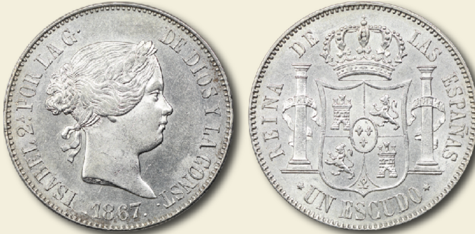
Spain 1867 1 escudo Madrid mint PCGS AU58 - ex Barinaga AR (0.900 silver) 29.5mm 12h Edge: LEY PATRIA REY * * * Type: Laureate Head Right O'Connor p.152 1E-1867M

The 1 escudo was issued from 1865 to 1868. This coin is identical in appearance to the 10 reales coin that it replaced, save for the denomination on the reverse.