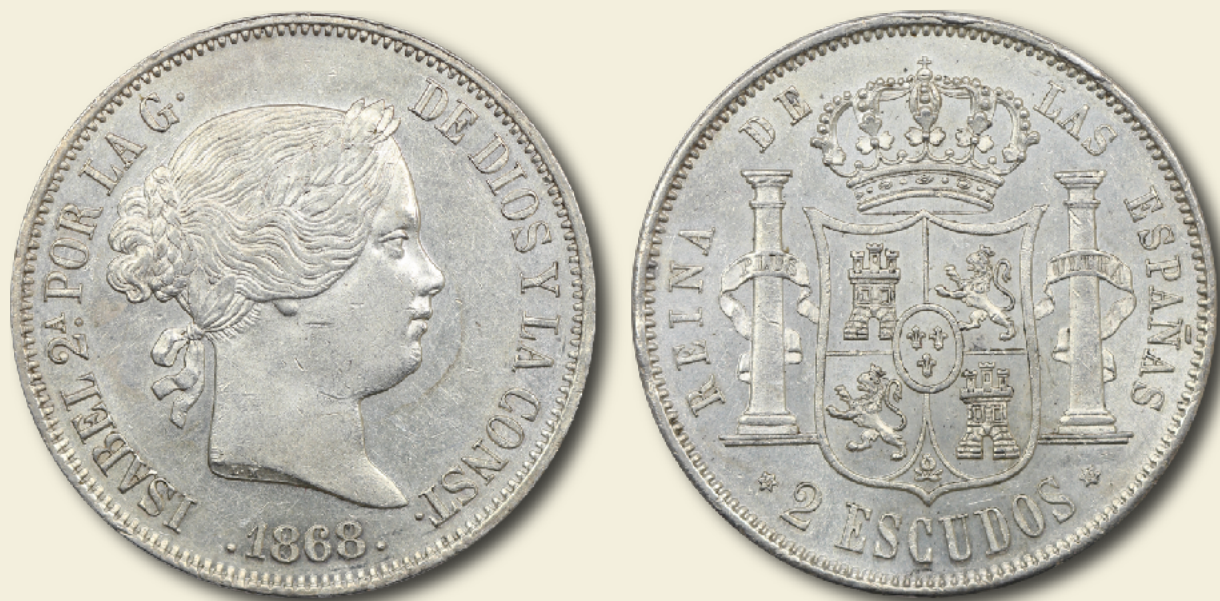
Spain 1868 2 escudos Madrid mint PCGS AU58 AR (0.900 silver) 37mm 12h Edge: LEY PATRIA REY *** Type: Laureate Head Right O'Connor p.153 2E-1868(68)M

The 2 escudos was issued from 1865 to 1868. This coin is identical in appearance to the 20 reales coin that it replaced, save for the denomination on the reverse.