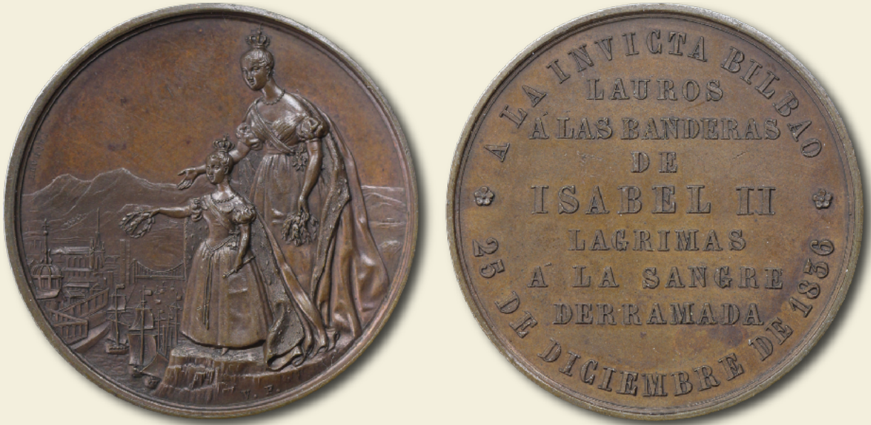
Spain 1836 Medal - Honoring the City of Bilbao Actual piece pictured in The Coins of Queen Isabel II of Spain Type: Young Queen Isabel II and her mother standing overlooking Bilbao Engraver: Pierre Lévêque AE 26.76g 41mm 12h Edge: plain (no markings) O'Connor p.236 M1836AE-Bilbao41

The medals produced during the reign of Isabel II include a wide array of pieces marking events in the life of Isabella and her family, commemorating milestones in Spain's history, and recognizing participants at expositions and contests. Presented herein are some fine examples of medallic art produced during the reign of Isabel II.