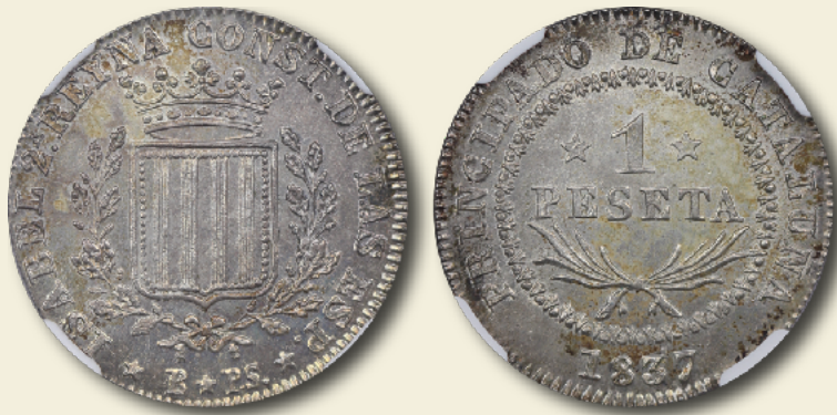
Cataluña 1837 1 peseta Barcelona mint NGC MS62 AR 25mm 12h Edge: reeded Type: Crowned Shield O'Connor p.165 1P-1837B-PS

The coin pictured above is an uncirculated example of the 6 cuartos type with lustrous brown surfaces. Despite a planchet flaw which appears as dark areas on the obverse, this is one of the most attractive examples of the type seen by this author.