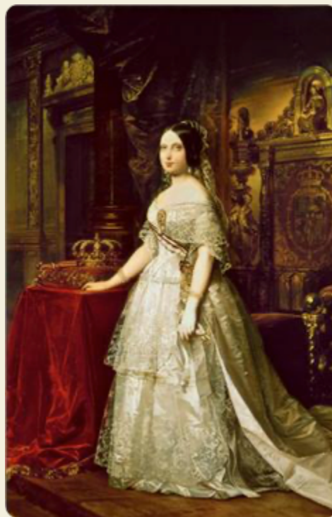
Isabel II of Spain - painting by Federico de Madrazo

The royal decree of 15 April 1848 introduced Spain's first decimal coinage. Under this system reales de vellón were the sole unit of account. Gold coins would be issued in a 100 reales denomination while silver coins continued largely as before except for modifications to their weight and purity in an attempt to combat their export. The maravedís were abandoned and décimas de real (tenths of a real) introduced as the copper coinage. The designs of all coins were revised to reflect the change in the coinage system.