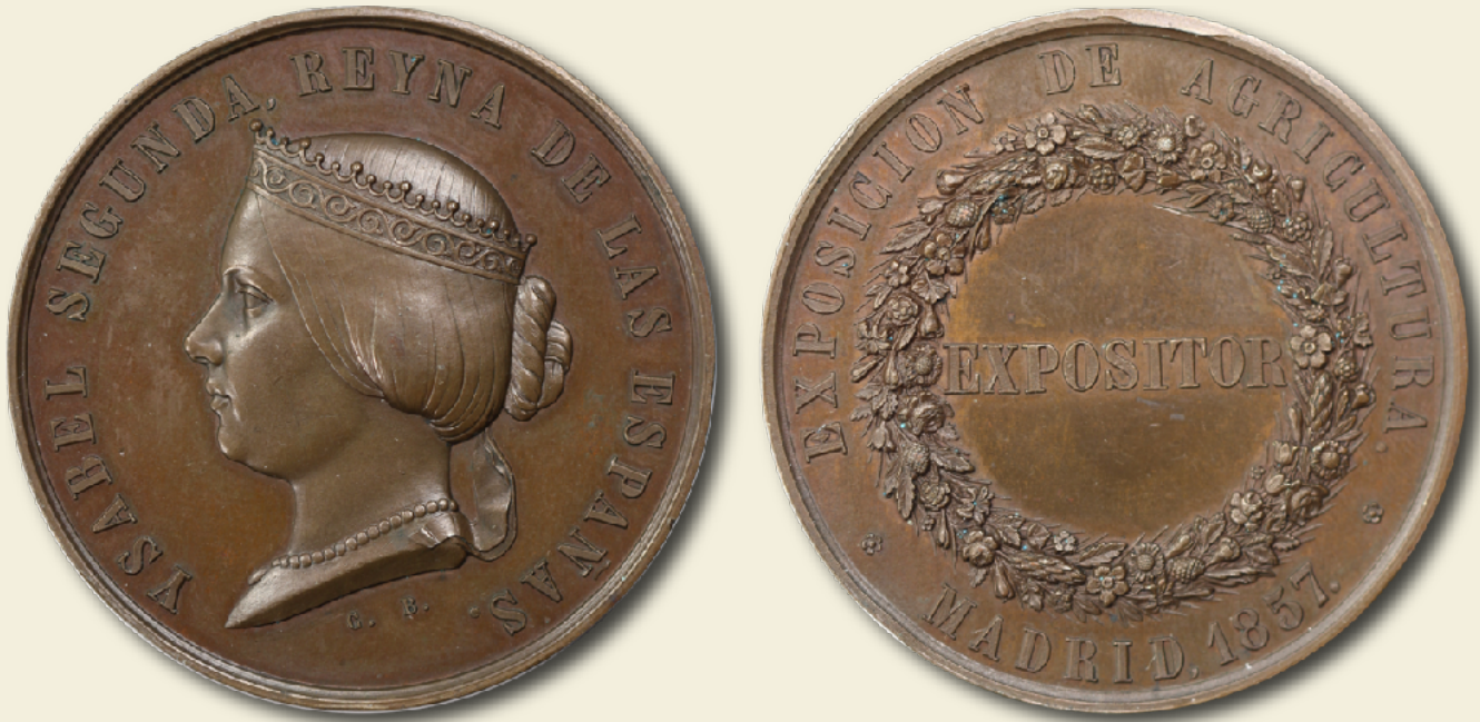
Spain 1857 Medal - Madrid Agricultural Exposition - Exhibitor

Actual piece pictured in The Coins of Queen Isabel II of Spain