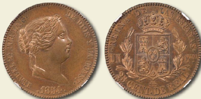
Spain 1854 25 céntimos de real Segovia mint NGC PF66RB - ex Lissner AE (bronze) 26mm 12h Edge: plain Type: Laureate Head Right - ribbon on neck O'Connor p.125 25CR-1854a

The 25 céntimos de real were of a single type issued from 1854 to 1864. In addition to Segovia, the Barcelona mint issued these in 1863 and 1864. Prior to the initial issue in 1854 several proof examples were made. The coin pictured here is one of those proof issues. It has exquisite chocolate brown surfaces and razor sharp details. Tied for finest seen by this author (with the other example offered in this group).