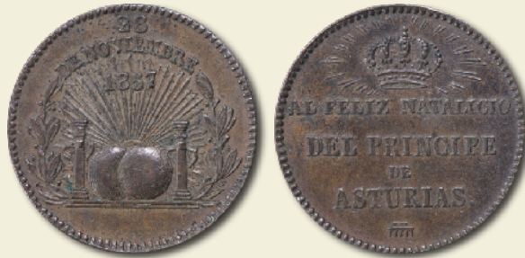
Spain 1857 Medal - Proclamation of Prince of Asturias Actual piece pictured in The Coins of Queen Isabel II of Spain AE 4.13g 20.3mm Edge: plain O'Connor p254 M1857AE-P-Prince

This medal was issued for the proclamation of the birth of Alfonso XII, Prince of Asturias. Alfonso XII later became King of Spain from 1875-1885 and was considered a good king who cared about his people.