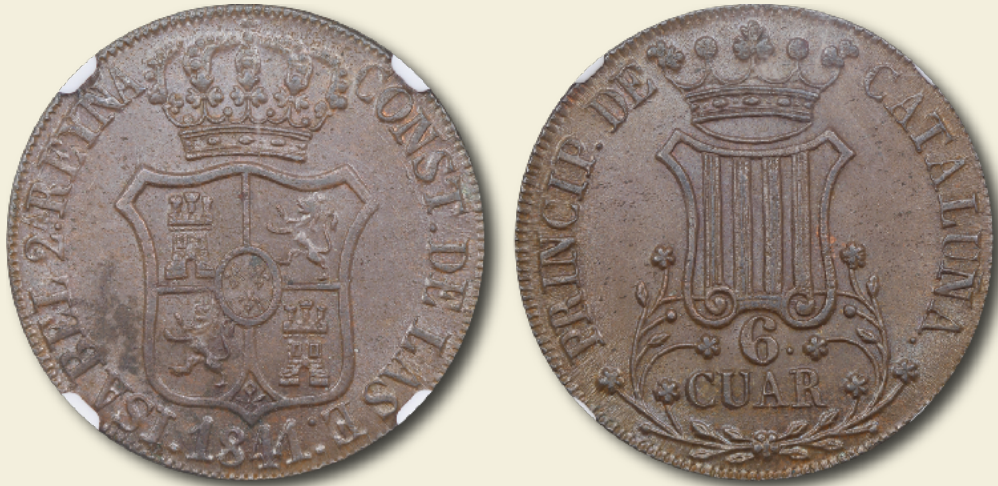
Cataluña 1841 6 cuartos Barcelona mint NGC MS63BN AE (copper) 32mm 12h Edge: dots within overlapping circles Type: Crowned Arms 6 CUAR O'Connor p.165 6C-1841B-5petals

The copper coins of Cataluña exist in five major types. The III quartos, III cuartos, 3 cuartos, VI quartos, and 6 cuartos. These are abbreviated QUAR and CUAR on the actual coins. Those with QUAR are much harder to find than those with CUAR, but all are scarce in XF condition or better.