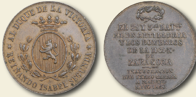
Spain 1856 Medal - Espartero and Inauguration of Zaragoza Railway Actual piece pictured in The Coins of Queen Isabel II of Spain AE 10g 26.8mm 12h Edge: plain (no markings) O'Connor M1856AE-ZRail

This medal commemorates Espartero's inauguration of a new railway from Zaragoza to Madrid. On the obverse is a crowned shield emblazoned with lion on gules tincture background, laurel leaves surround shield; legend surrounds: * AL DUQUE DE LA VICTORIA * REINANDO ISABEL SEGUNDA