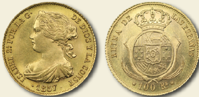
Spain 1857 100 reales Barcelona mint PCGS MS64 AV (0.900 gold) 22.1mm 12h Edge: reeded Type: Draped Laureate Bust Left O'Connor p.137 100R-1857B

This particular coin was minted in Madrid as indicated by the 6 pointed stars at either side of the denomination on reverse. Frosty luster pervades fields and devices on both sides of this remarkable coin. Without a doubt one of the finest examples of the type.