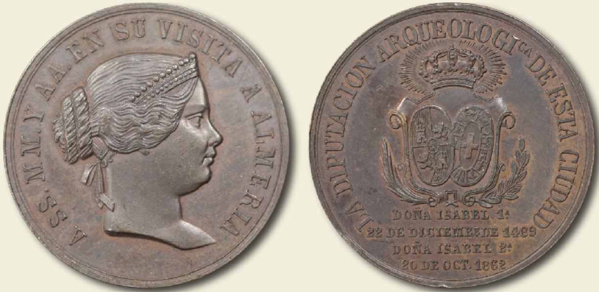
Spain 1862 Medal - Queen's Visit to Almeria Actual piece pictured in The Coins of Queen Isabel II of Spain AE 22.86g 36.8mm x 2.6mm Edge: plain Type: Laureate Head of Queen Isabel II Right O'Connor p271 M1862AE-Almeria

The obverse depicts Isabel II with an excessively abbreviated legend that appears to address her majesty Queen Isabel II, the King Consort, and Alfonso XII - Prince of Asturias on the visit to Almeria. The reverse identifies the city's archeological society and commemorates two visits to Almeria: the first in 1489 by Queen Isabel of Spain and the second in 1862 by Queen Isabel II.