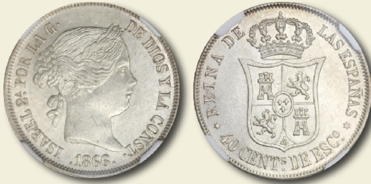
Spain 1866 40 céntimos de escudo Madrid mint NGC MS61 - ex Barinaga AR (0.810 silver) 23.5mm 12h Edge: reeded Type: Laureate Head Right O'Connor p.151 40CE-1866M

The 40 céntimos de escudo was issued from 1864 to 1868. It had a value in the range of common purchases while having a lower silver content than the larger silver coins being exported at this time. As such, this was the workhorse silver coin of its day. Most are encountered heavily worn or damaged. Problem free examples above XF are extremely difficult to find.