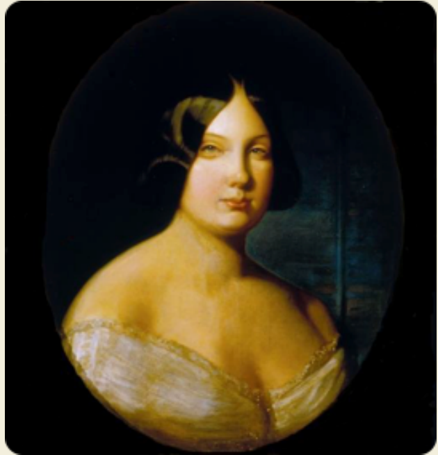
Queen Isabel II of Spain - portrait by Dionisio Fierros, 1853

Spain was in a state of transformation throughout the 19th century. The Spanish empire once encompassed much of the known world including most of North and South America, the Philippines, and portions of Africa. By the 1820's much of that empire had been sold or lost to revolutions. France invaded and controlled Spain for a time before the Spanish pushed them out. Wars and poor fiscal policy placed Spain in a dire economic position. The people of Spain struggled with their own political factions and other European powers to establish Spain's new destiny. It was into this turbulent period of history that Queen Isabel II was born. The study of coins of her reign is a wondrous adventure through history, heraldry, economics, politics, intrigues, and stories seemingly beyond belief.