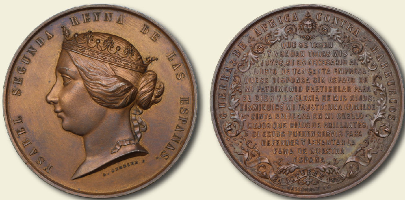
Spain 1859 Medal - Africa Campaign - NGC MS61RB Actual piece pictured in The Coins of Queen Isabel II of Spain AE 57.6mm 12h Edge: plain (no markings) Type: Crowned Bust of Queen Isabel II Left Engraver: Louis Adolpe Gerbier; Editor: Francois Massonet O'Connor M1859AE-AfricaWar

This medal commemorates Spain's military campaign in Africa.