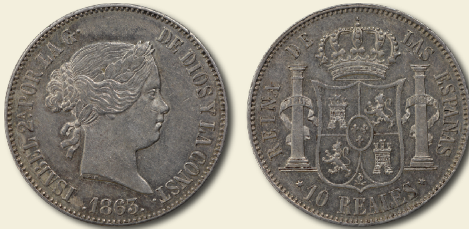
Spain 1863 10 reales Madrid mint PCGS AU55 AR (0.900 silver) 29mm 12h Edge: LEY PATRIA REY * * * Type: Laureate Head Right O'Connor p.130 10R-1863M

The coin pictured above is an attractive example of the type. Remaining luster on the bust helps it stand out from the fields, giving this 1857 10 reales coin a beautiful semi-cameo appearance amid lightly marked fields and champagne color near the rim. The reverse has few marks, notable luster, and the same pleasing champagne color.