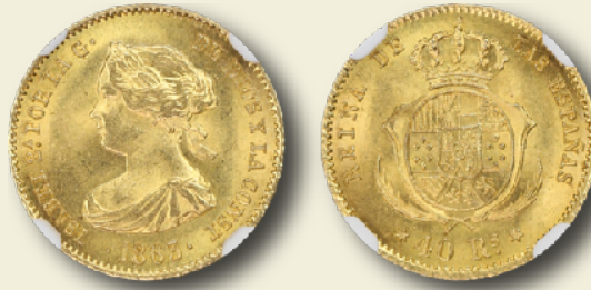
Spain 1863 40 reales Madrid mint NGC MS64 AV (0.900 gold) 18mm 12h medal alignment, reeded edge Type: Draped Laureate Bust Left O'Connor p.135 40R-1863M

The 40 reales of this type were issued from 1856 to 1863 at the Madrid and Barcelona mints.