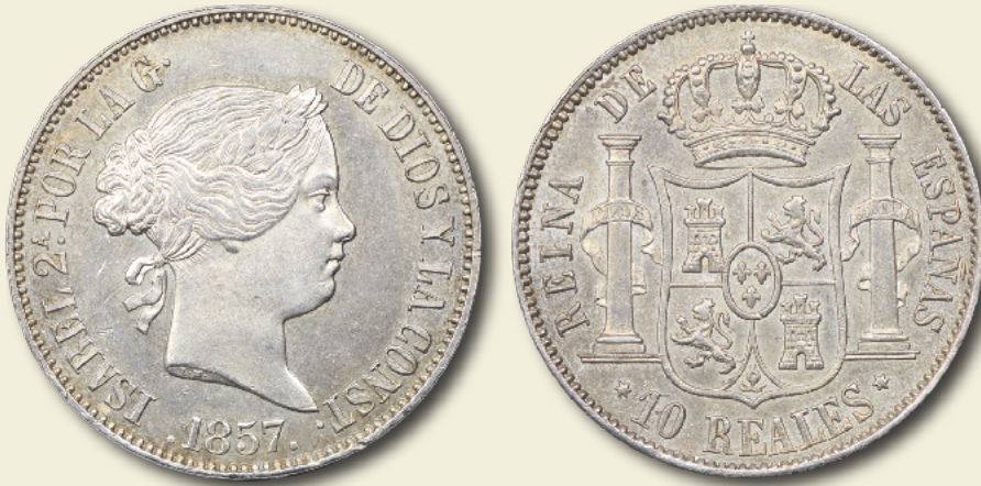
Spain 1857 10 reales Madrid mint PCGS MS62 AR (0.900 silver) 29.4mm 12h Edge: LEY PATRIA REY * * * Type: Laureate Head Right O'Connor p.130 10R-1857M

The 10 reales of this type were issued from 1857 to 1864.