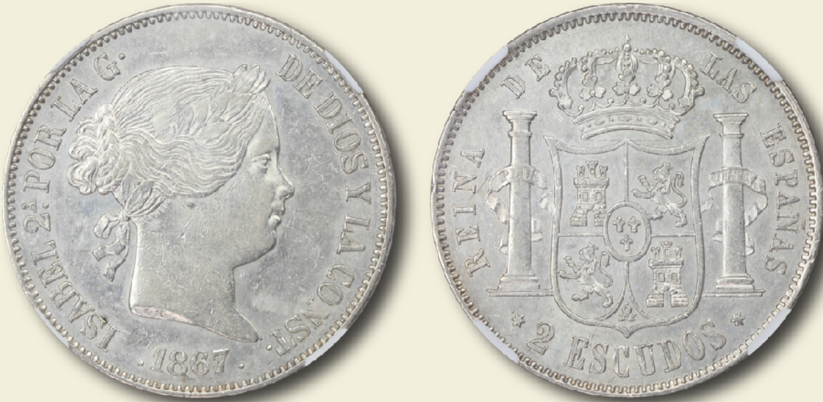
Spain 1867 2 escudos Madrid mint NGC AU55 AR (0.900 silver) 37mm 12h Edge: LEY PATRIA REY *** Type: Laureate Head Right O'Connor p.153 2E-1867M

The 2 escudos was issued from 1865 to 1868. This coin is identical in appearance to the 20 reales coin that it replaced, save for the denomination on the reverse.