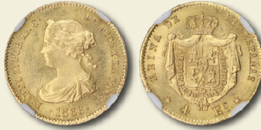
Spain 1866 4 escudos Madrid mint NGC MS64 AV (0.900 gold) 17mm 12h Edge: reeded Type: Draped Laureate Bust Left O'Connor p.156 4E-1866M

The 4 escudos was issued from 1865 to 1868.