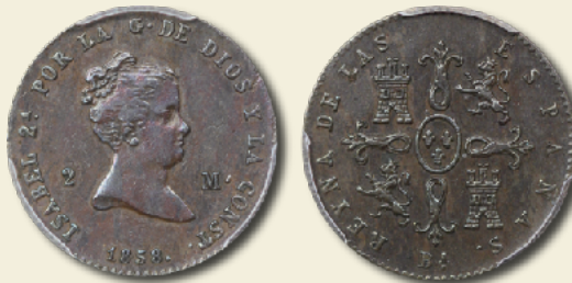
Spain 1858 2 maravedís Barcelona mint PCGS AU55 AE (copper) 19mm 12h Edge: reeded Type: Pearl Bun Head Right O'Connor p.79 2M-1858B

Spain issued only one type of 2 maravedís of Queen Isabel II. The coin above has lustrous red brown surfaces and few marks. Both sides, especially the reverse, have mirrored iridescent surfaces when viewed in hand. A stunning example of the type.