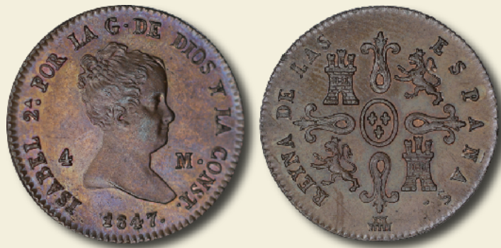
Spain 1847 4 maravedís Segovia mint PCGS MS64BN AE (copper) 24mm 12h Edge: reeded Type: Pearl Bun Head Right - Denomination on Obverse O'Connor p.81 4M-1847a

Spain issued two types of 4 maravedís during the reign of Isabel II which are distinguished by the placement of the denomination on reverse or obverse. All of them pictured Isabel II on obverse and a stylized cross with castles & lions on the reverse. The coin pictured above is of the second type with legend ending CONST.