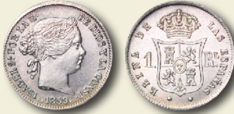
Spain 1859/7 1 real Madrid mint Gem Uncirculated AR (0.900 silver) 15mm 12h Edge: reeded Type: Laureate Head Right O'Connor p.126 1R-1859M

The 1 real coins of this type were issued from 1857 to 1864.