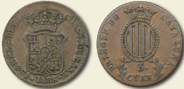
Cataluña 1838 3 cuartos Barcelona mint AE (copper) 26.1mm 6.96g 12h Edge: dots within overlapping circles Type: Crowned Arms 3 CUAR O'Connor p.163 3C-1838B

The copper coins of Cataluña exist in five major types. The III quartos, III cuartos, 3 cuartos, VI quartos, and 6 cuartos. These are abbreviated QUAR and CUAR on the actual coins. Those with QUAR are much harder to find than those with CUAR, but all are scarce in XF condition or better.