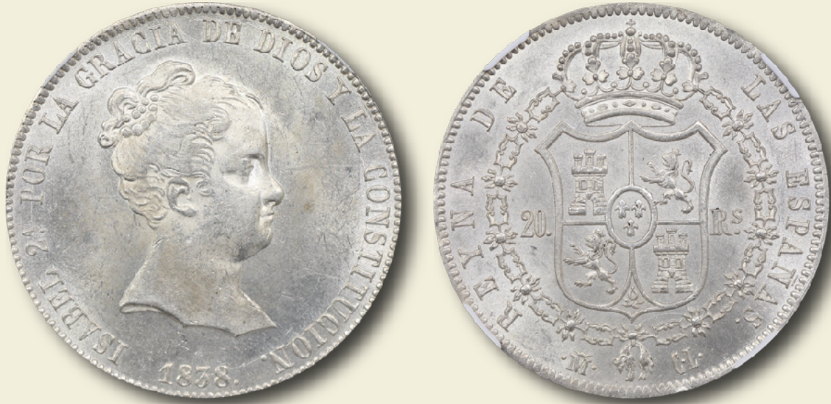
Spain 1838 20 reales Madrid mint NGC MS63 - ex Barinaga Assayers: CL = José Luis de C astroviejo - Eugenio L arra AR (0.9027 silver) 37mm 12h Edge: LEY PATRIA REY * * * Type: Pearl Bun Head Right - Legend Ends CONSTITUCION O'Connor p.99 20R-1838M-CL

Spain issued two types of Kingdom 20 reales of Isabel II. They are distinguished by the legend, with one ending DIOS and the other ending CONSTITUCION. All of them pictured Isabel II on the obverse and crowned arms encircled by the Chain of the Order of the Golden Fleece on the reverse. The constant export of Spanish 20 reales during the mid 1800s makes finding an eye appealing example very challenging and Kingdom period 20 reales are the most challenging among these.