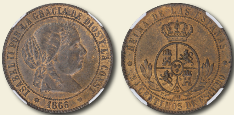
Spain 1866 2 1/2 céntimos de escudo Barcelona mint NGC MS64RB - ex Lissner AE (bronze) 25mm 12h Edge: plain Type: Ringlet Head Right O'Connor p.146 2MCE-1866B-OM

Isabel II 5 céntimos were struck from 1865 through 1868 of one type and two major varieties. The first variety without the initials "OM" on the reverse beneath the oval and the second variety with the "OM" mark. Both varieties were struck by Oeschger Mesdach & Co., but early issues lacked the "OM" marking.