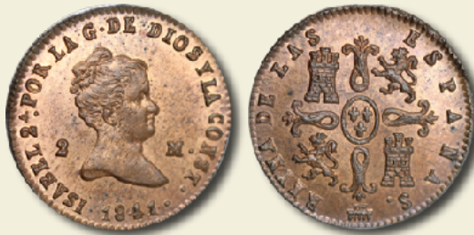
Spain 1841 2 maravedís Segovia mint PCGS MS64RB - ex Barinaga AE (copper) 19.4mm 12h Edge: reeded Type: Pearl Bun Head Right O'Connor p.78 2M-1841a

The 1 maravedís coin pictured above has lustrous red brown surfaces and almost no marks. An excellent example of the type.