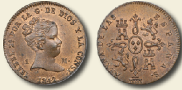
Spain 1842 1 maravedís Segovia mint PCGS MS65RB - ex Barinaga AE (copper) 14.3mm 12h Edge: reeded Type: Pearl Bun Head Right O'Connor p.77 1M-1842a

Spain issued only one type of 1 maravedís (1842-1843) of Queen Isabel II.