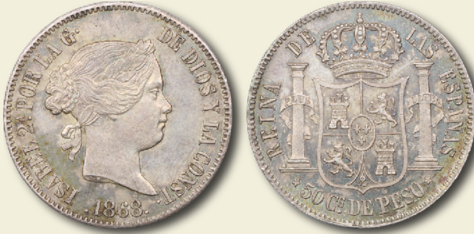
Philippines 1868 50 centavos de peso Manila mint PCGS MS62 Actual piece pictured in The Coins of Queen Isabel II of Spain AR (0.900 silver) 29.6mm 12h Edge: LEY PATRIA REY *** Type: Laureate Head Right O'Connor p.176 50CP-1868m

The Isabel II silver 50 centavos de peso was minted from 1865 to 1868 and has only one type. It is identical in size and weight to the 1 escudo of Spain and has the same design elements with the exception of the denomination on the reverse and the five pointed stars surrounding it. The five pointed stars identify it as a product of the Manila mint.