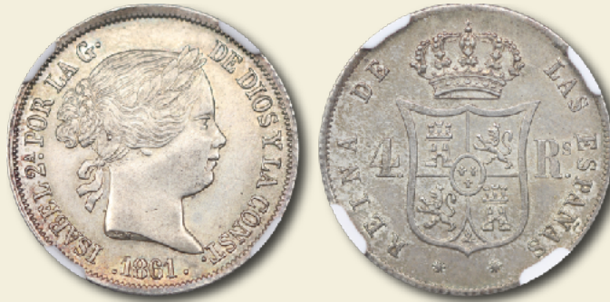
Spain 1861 4 reales Madrid mint NGC AU58 AR (0.900 silver) 23mm 12h Edge: reeded Type: Laureate Head Right O'Connor p.128 4R-1861M

The 4 reales of this type were issued from 1856 to 1864. The 4 reales was also commonly referred to as a peseta. Coins of this size were among the more frequently used silver coins in Spain.